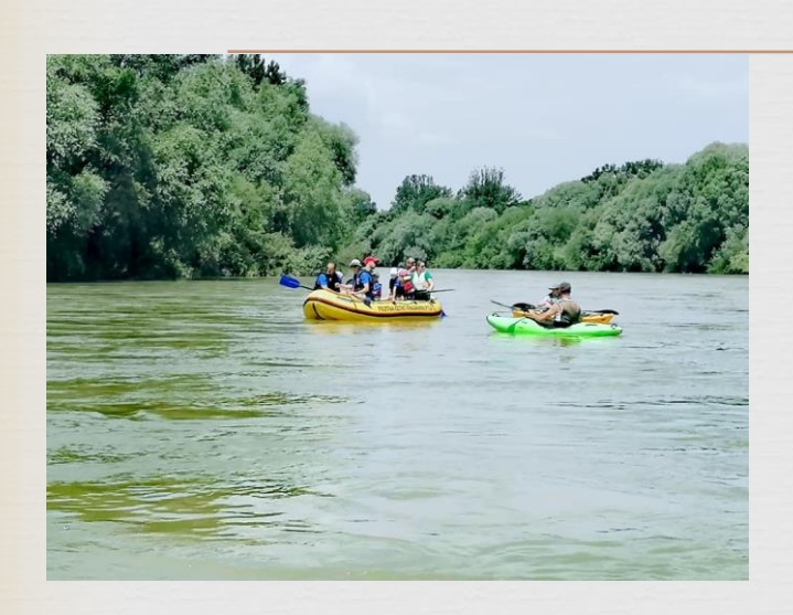
Drava river sports product