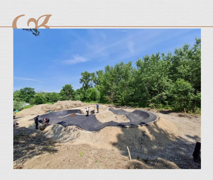
Pumptrack in progres

And much more interesting storys! You are welcome!!!