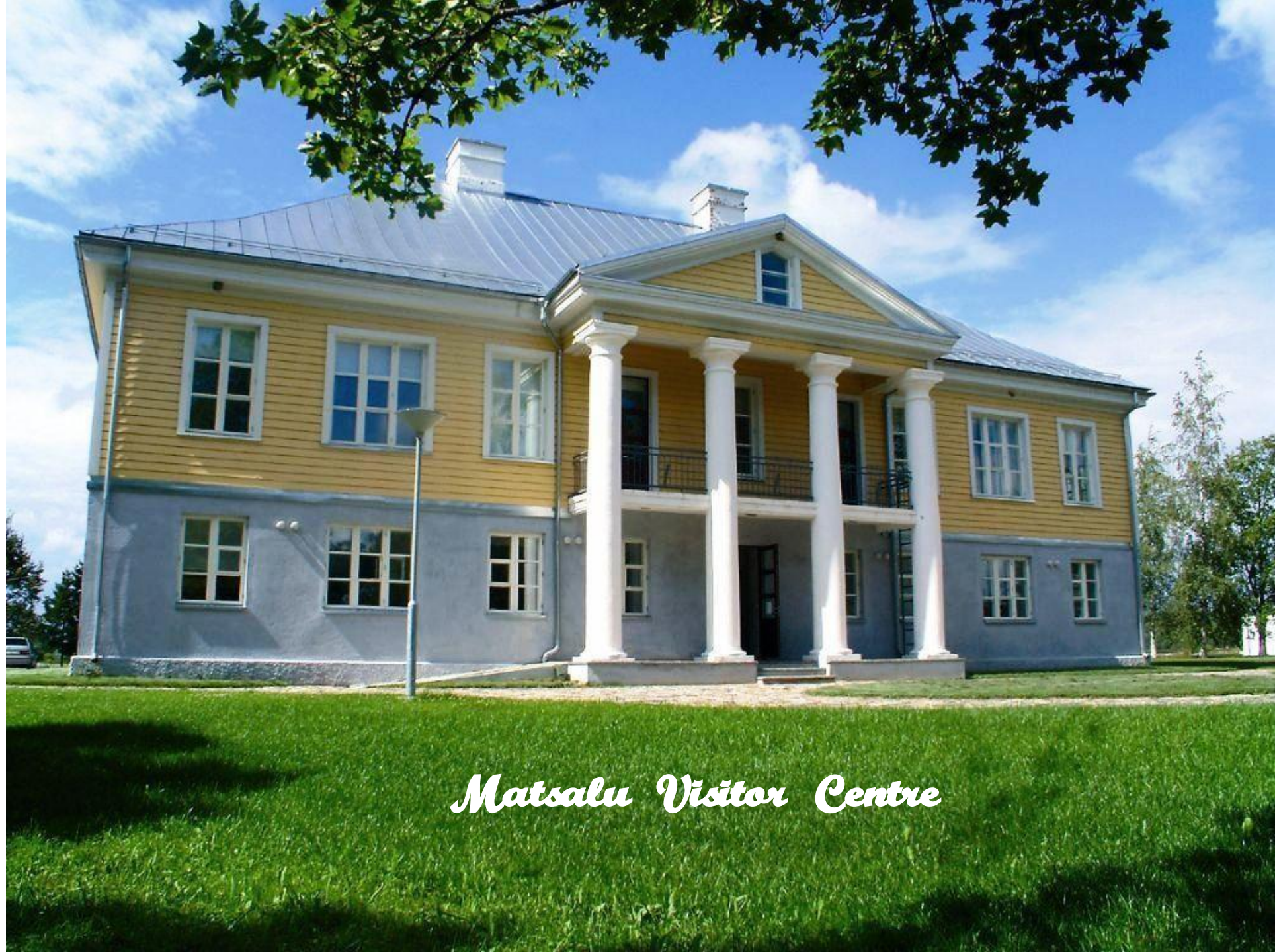
Matsalu Visitor Centre