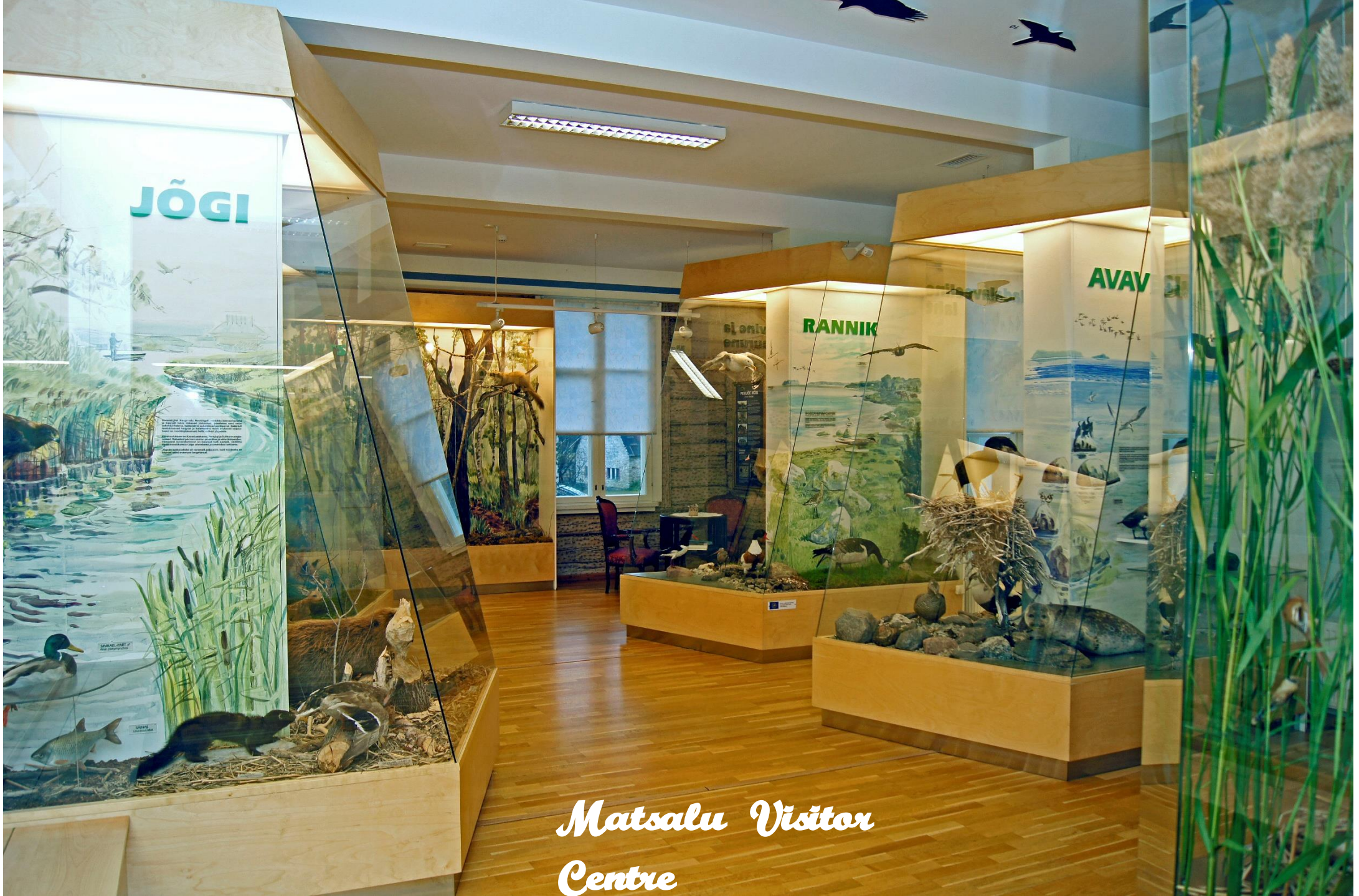
Matsalu Visitor Centre