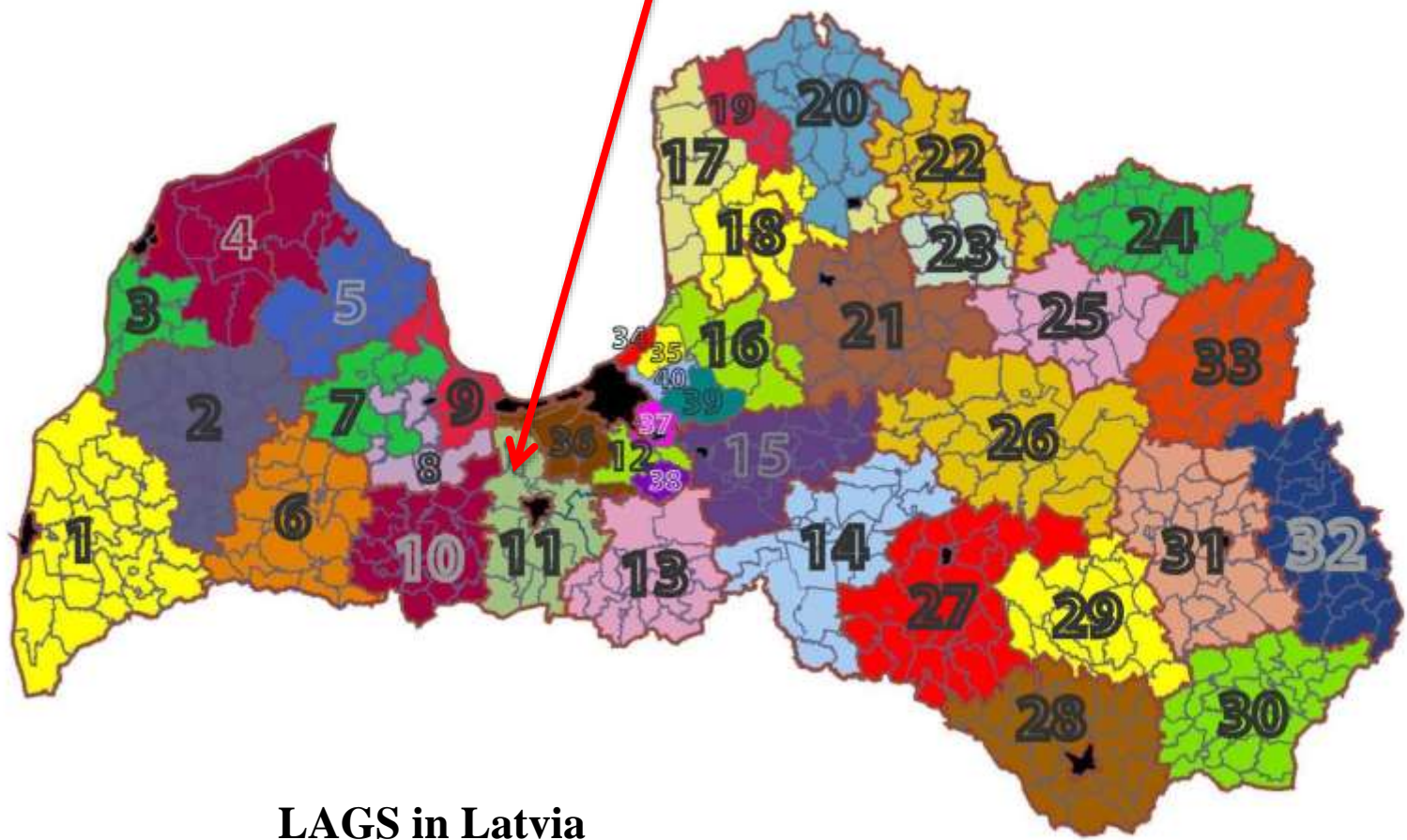
LAGS in Latvia